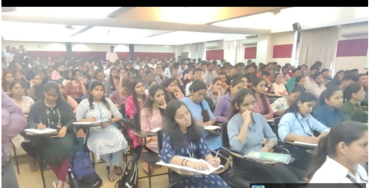
. Active participation by students in GTT training Programme.