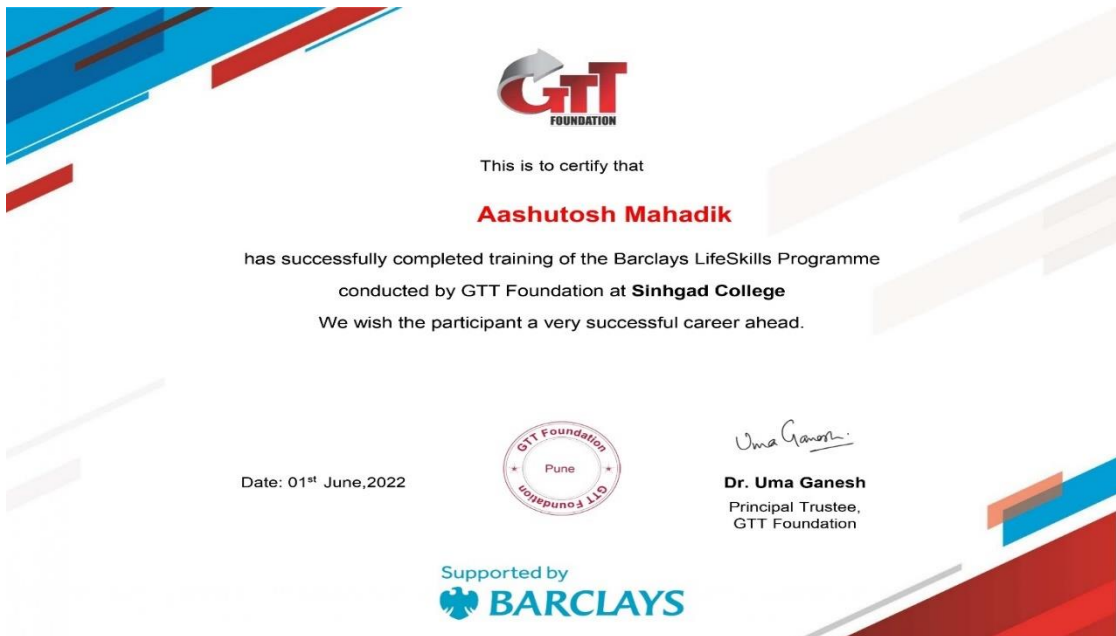
Certificates by GTT to the Participant students