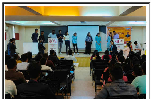
ICE BREAKING ACTIVITIES