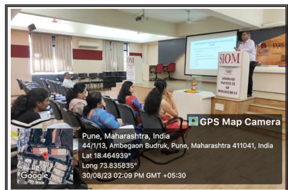
VALUE ADDED COURSES

The session was then followed by ice breaking sessions.